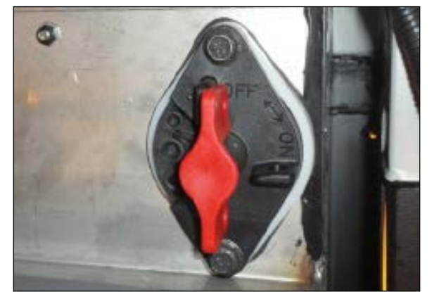
BATTERY MASTER SWITCH

1. Turn the battery master switches (ignition and master cut-out) to the ON position;