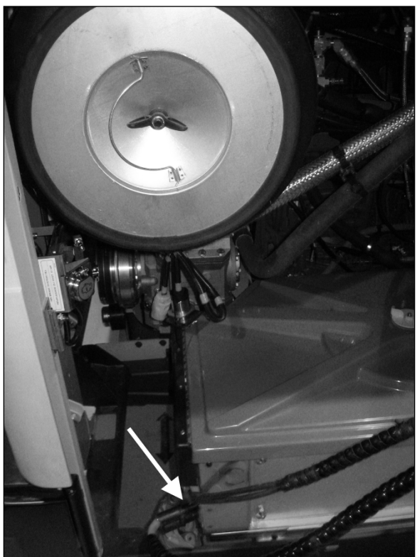
BOOSTER BLOCK LOCATION

Jumper cables must be rated at 500 cranking amperes. If jumper cable length is 20 feet (6 m) or less, use 2/0 (AWG) gauge wires. If cable length is between 20 to 30 feet (6 to 9 m), use 3/0 (AWG) gauge wires.