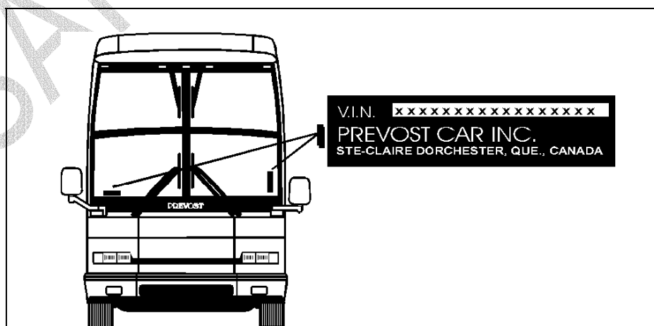
FIGURE 1: LOCATION OF PLATE ON H3 AND XL VEHICLE SERIES