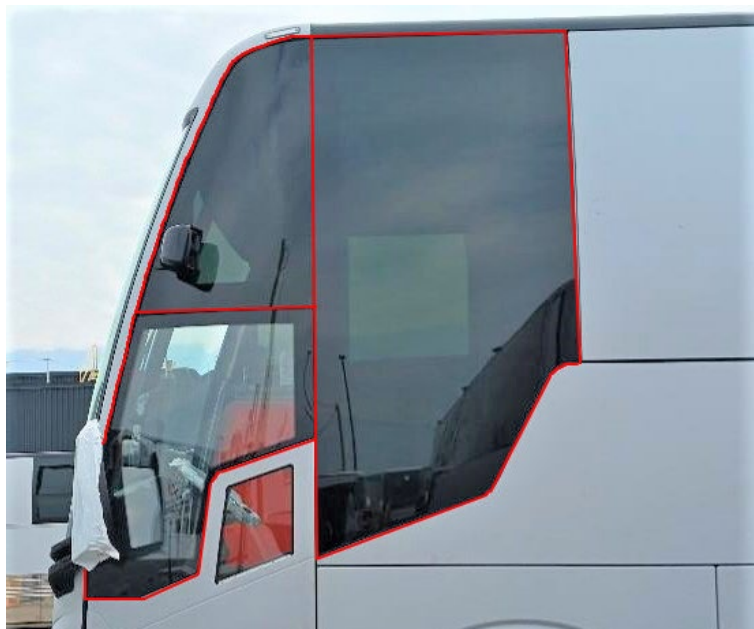
FIGURE 2 : FRONT PART OF A H3 VIP SHOWING GAP AREA