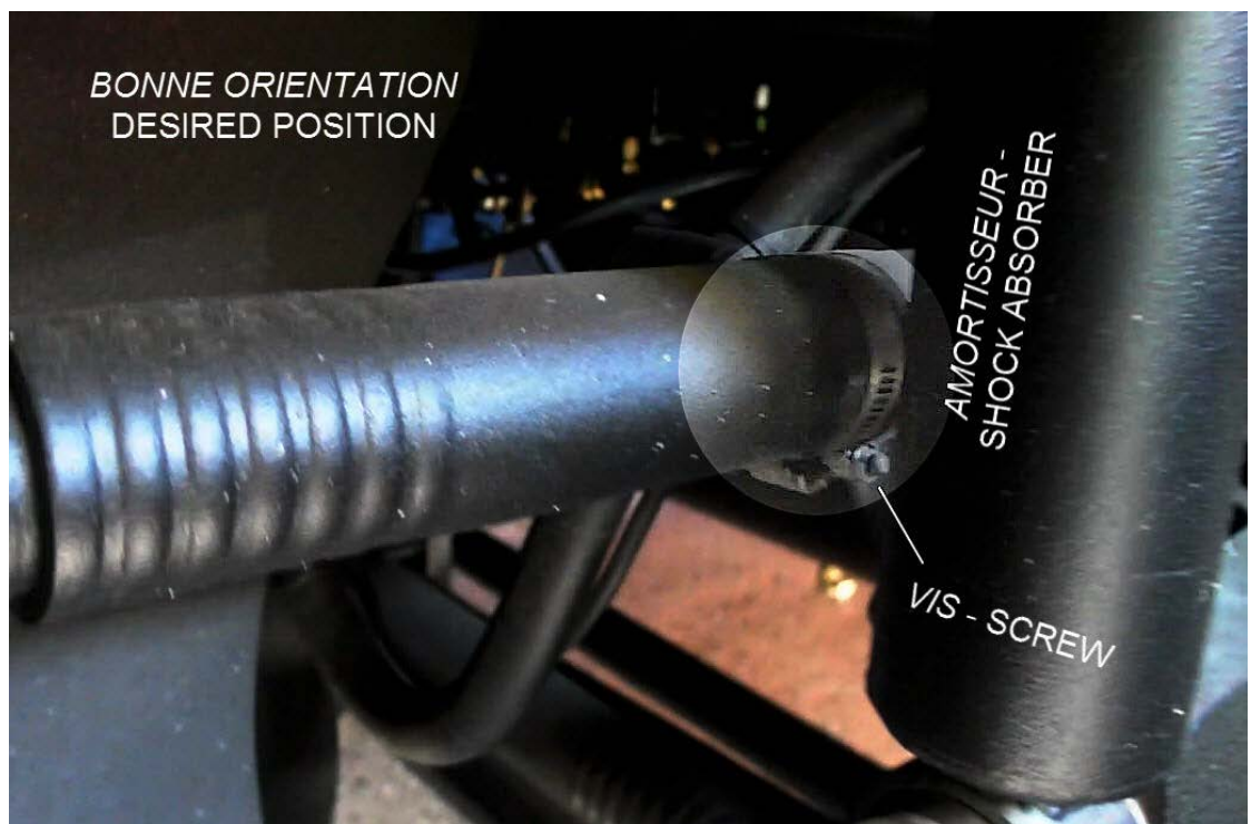
Figure 2: DESIRED ORIENTATION