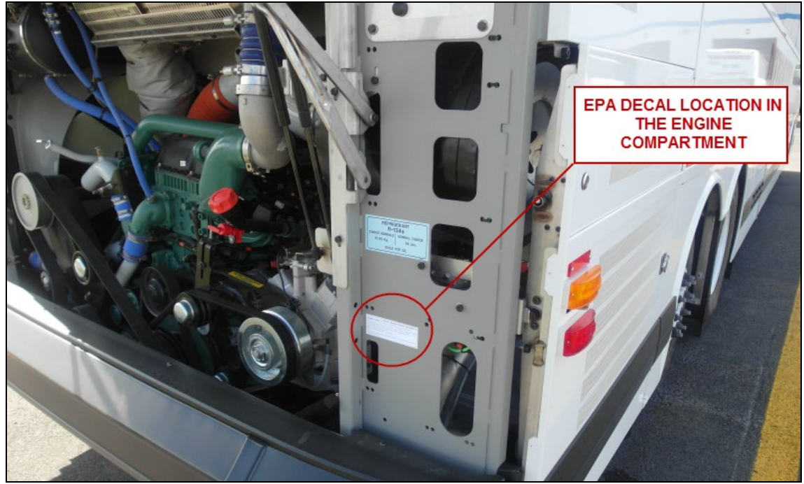
FIG.3 EPA DECAL LOCATION ON THE VEHICLE

FIG.2 VALIDATE VEHICLE VIN BEFORE FINAL INSTALLATION - US BUILD VEHICLE SHOWN