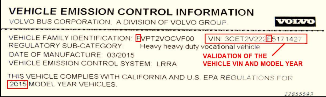
FIG.2 VALIDATE VEHICLE VIN BEFORE FINAL INSTALLATION (2015 VEHICLE SHOWN)

FIG.1 CORRECT INFORMATION ON NEW EPA DECAL (2016 VEHICLE SHOWN)