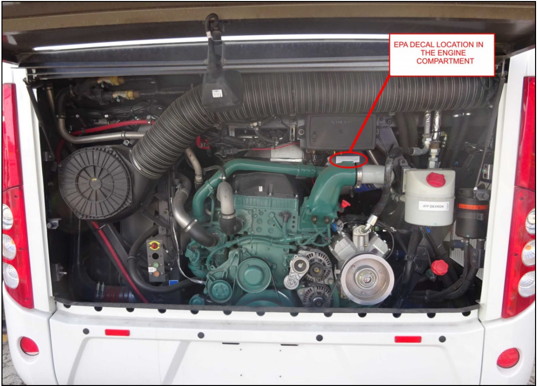
FIG.4 EPA DECAL LOCATION IN THE VEHICLE ENGINE COMPARTMENT