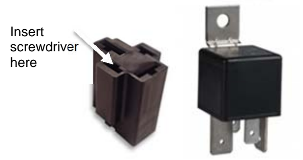
FORMER RELAY BASE