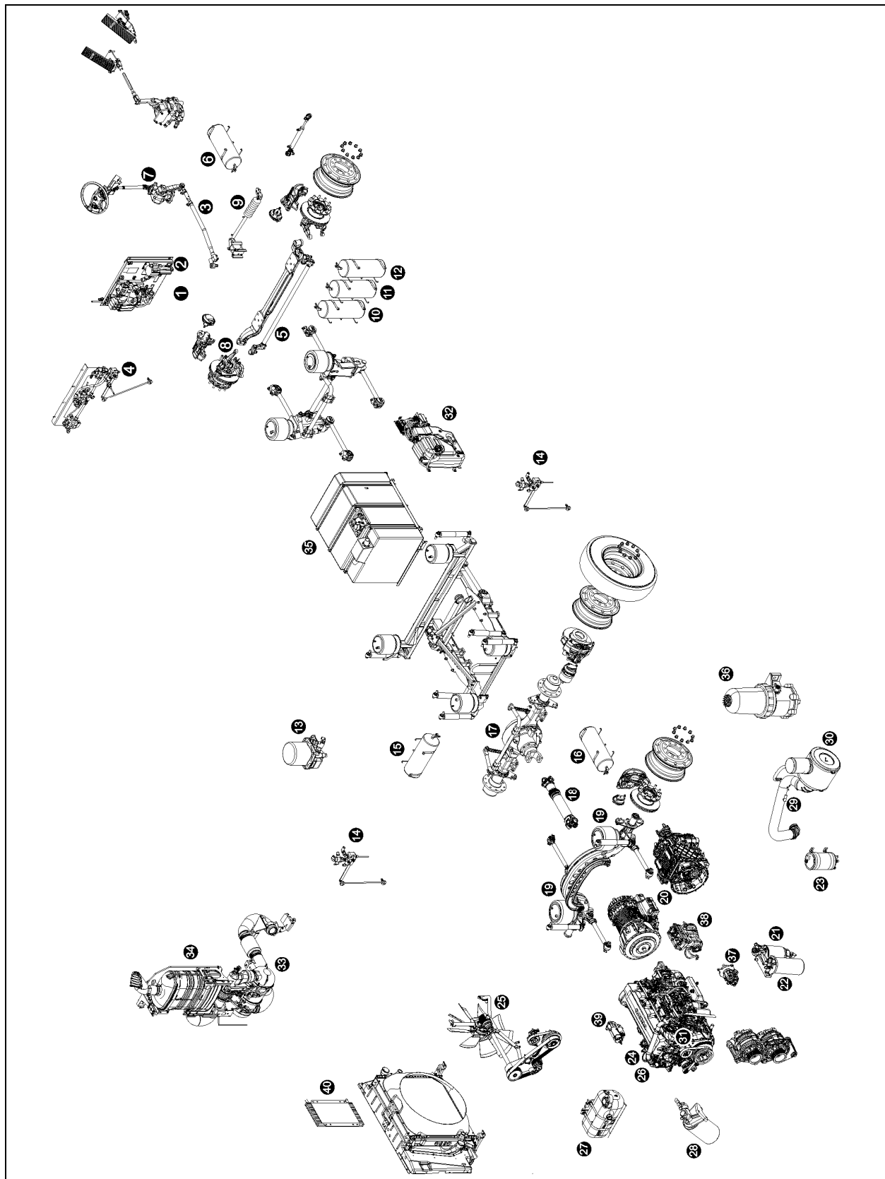
FIGURE 1: LUBRICATION AND SERVICING POINTS (I-BEAM FRONT AXLE SHOWN) TYPICAL