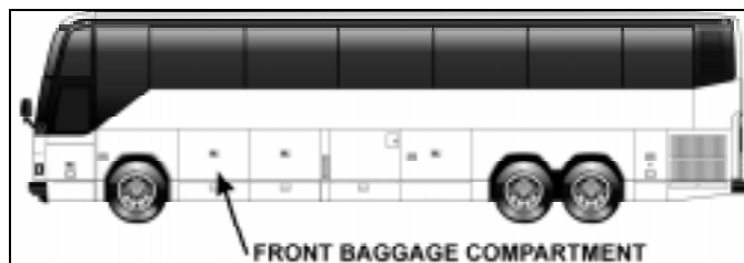
FIGURE 1: LOCATION OF FRONT BAGGAGE COMPARTMENT