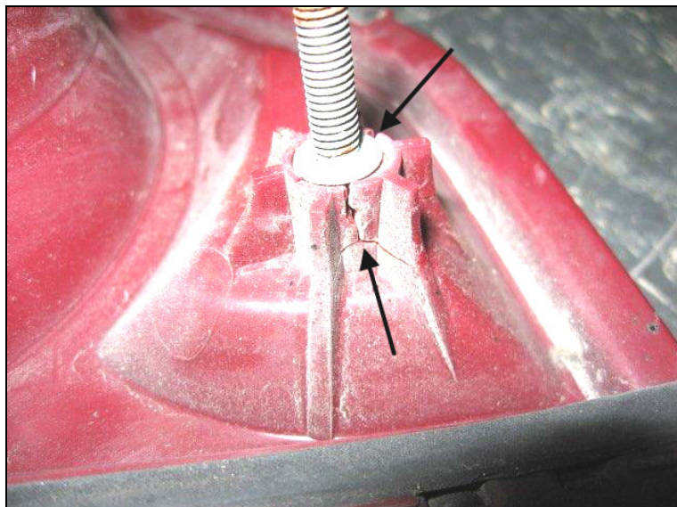
FIGURE 2: Cracks at the boss and ribs due to the use of engine degreaser