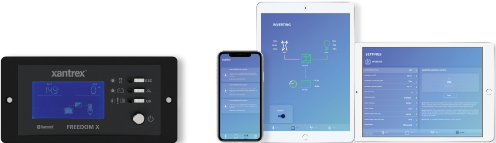
FREEDOM X BLUETOOTH REMOTE PANEL (808-0817-02)