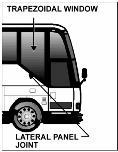
FIGURE 3: WINDOW JOINT

1. Apply masking tape on each side of joint in order to protect vehicle finish (refer to fig. 3).