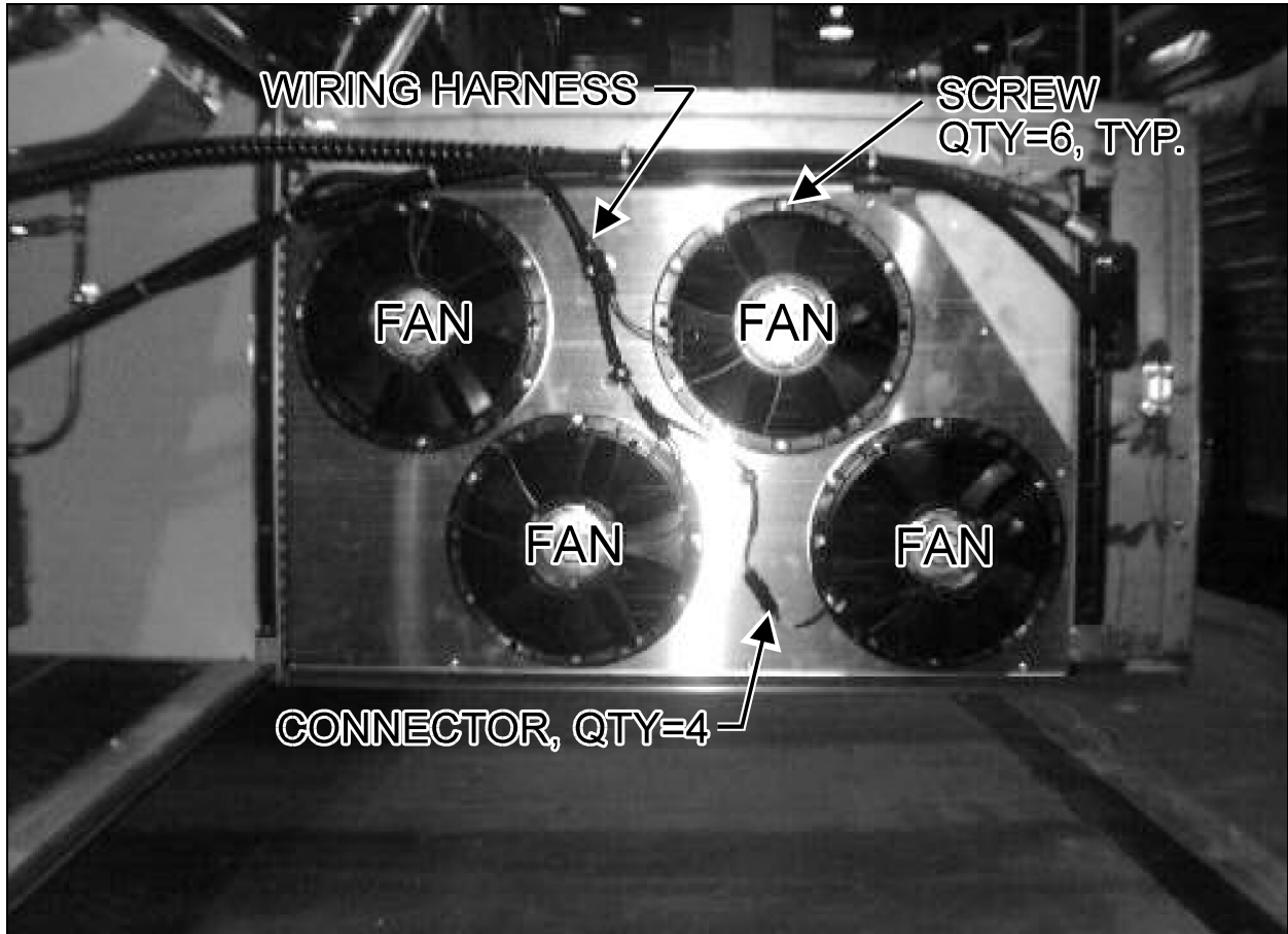
FIGURE 1: CONDENSER DOOR - INSIDE FACE