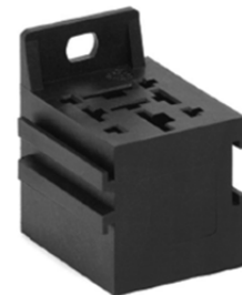
NEW RELAY AND BASE