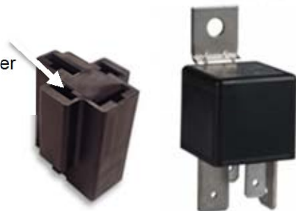
FORMER RELAY BASE