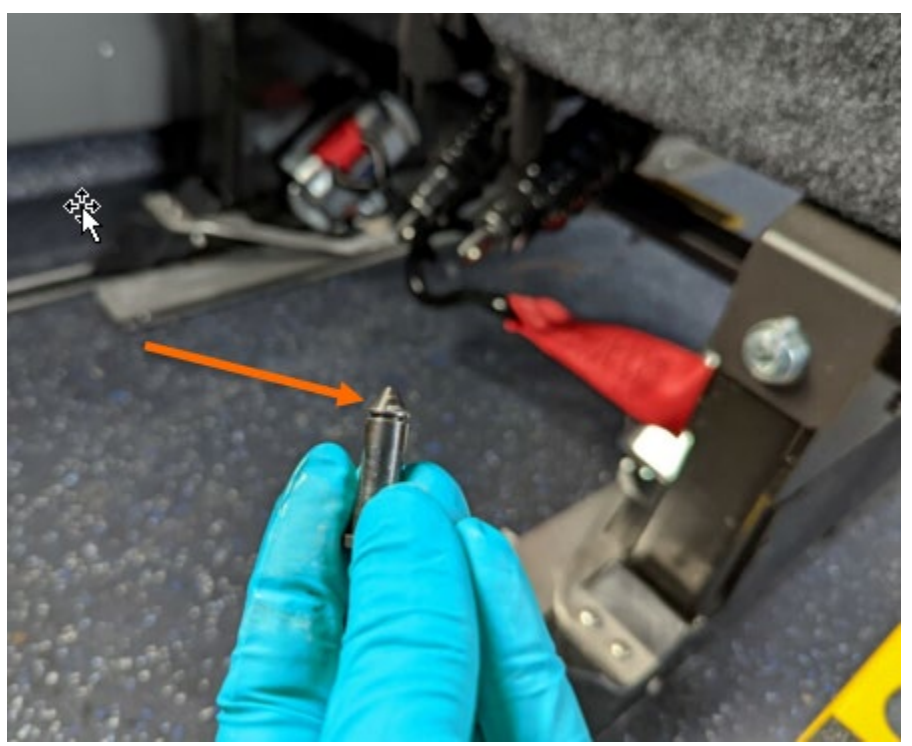
Figure 4: PIN