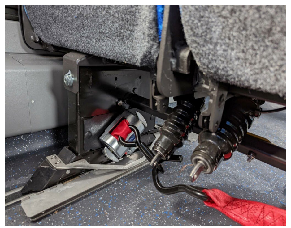
Figure 3: PIN MISSING