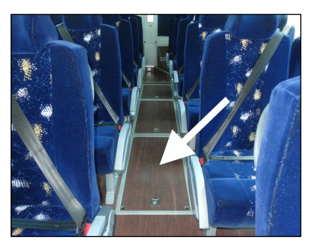
Figure 1 (Volvo 9700 models)

2. Locate the piston actuator identification label.